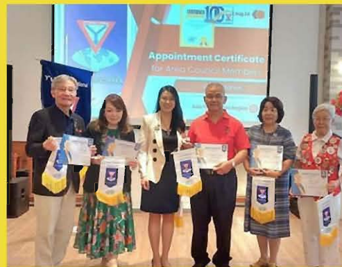
Area Service Directors & Regional Director Elect