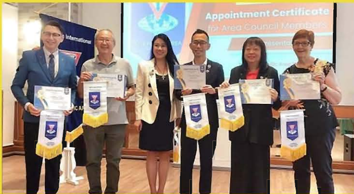
Regional Directors & Representatives