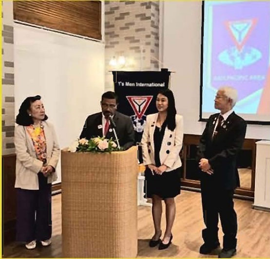
Area President Installation