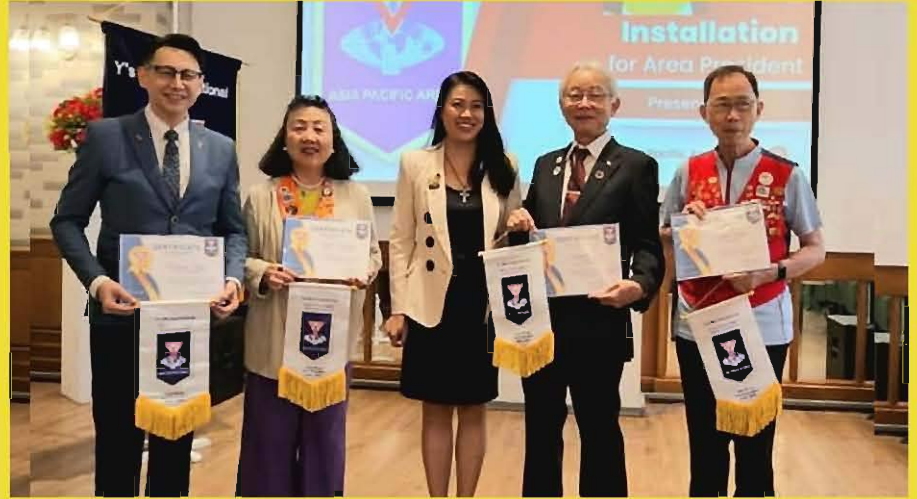
Area Executive Officers